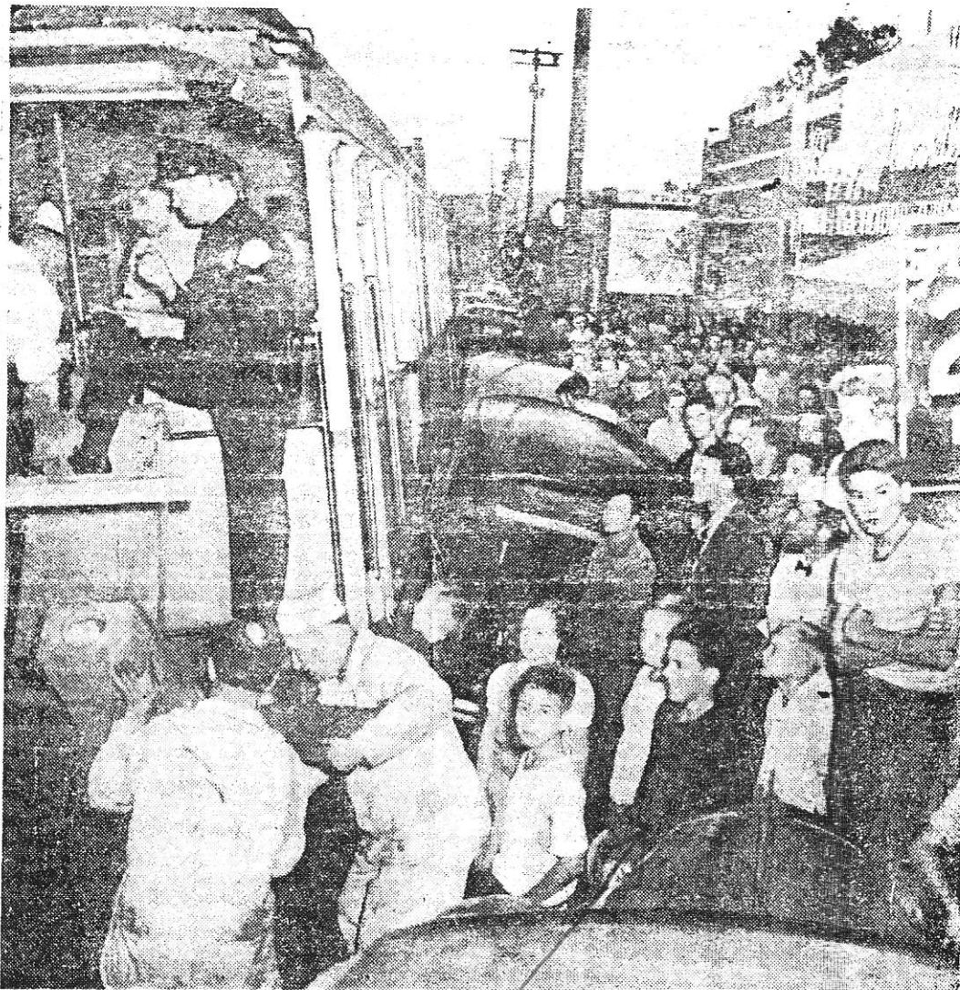
RUNS WILD —This streetcar, at rest at last at intersection of Colorado and Eagle Rock boulevards where it jumped track, smashing

seven autos, slipped brakes while crew was eating and raced six blocks before final crash. One passenger was aboard. (Story is on Page 5.)